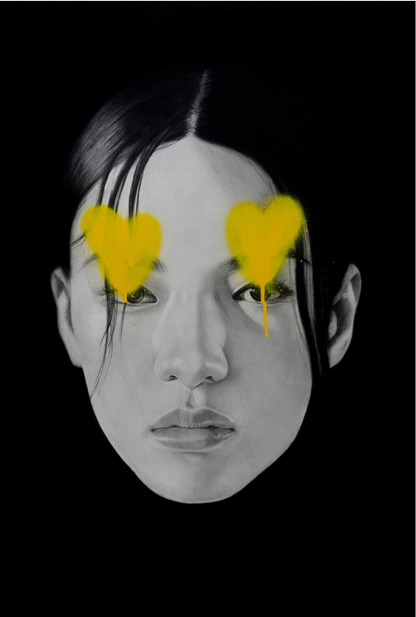
SPRAYED M3 size: 54 x 74 cm year: 2023