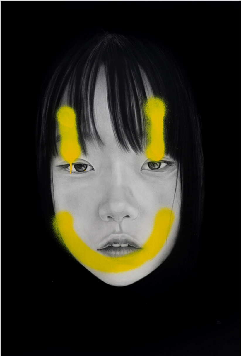
SPRAYED M1 size: 54 x 74 cm year: 2023

media: graphite, charcoal, spray pain and acrylic paint on paper mounted on wood panel