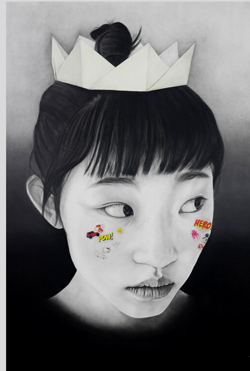
NEON QUEEN size: 97 x 130 cm year: 2021