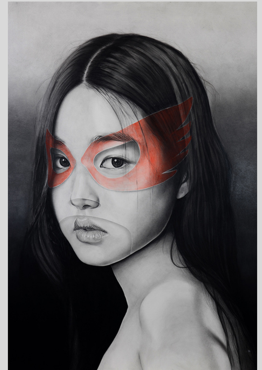
(UN)MASKED FIGHTER size: 97 x 130 cm year: 2021