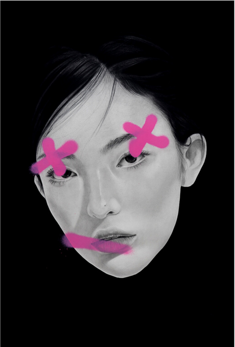
SPRAYED M2 size: 54 x 74 cm year: 2023