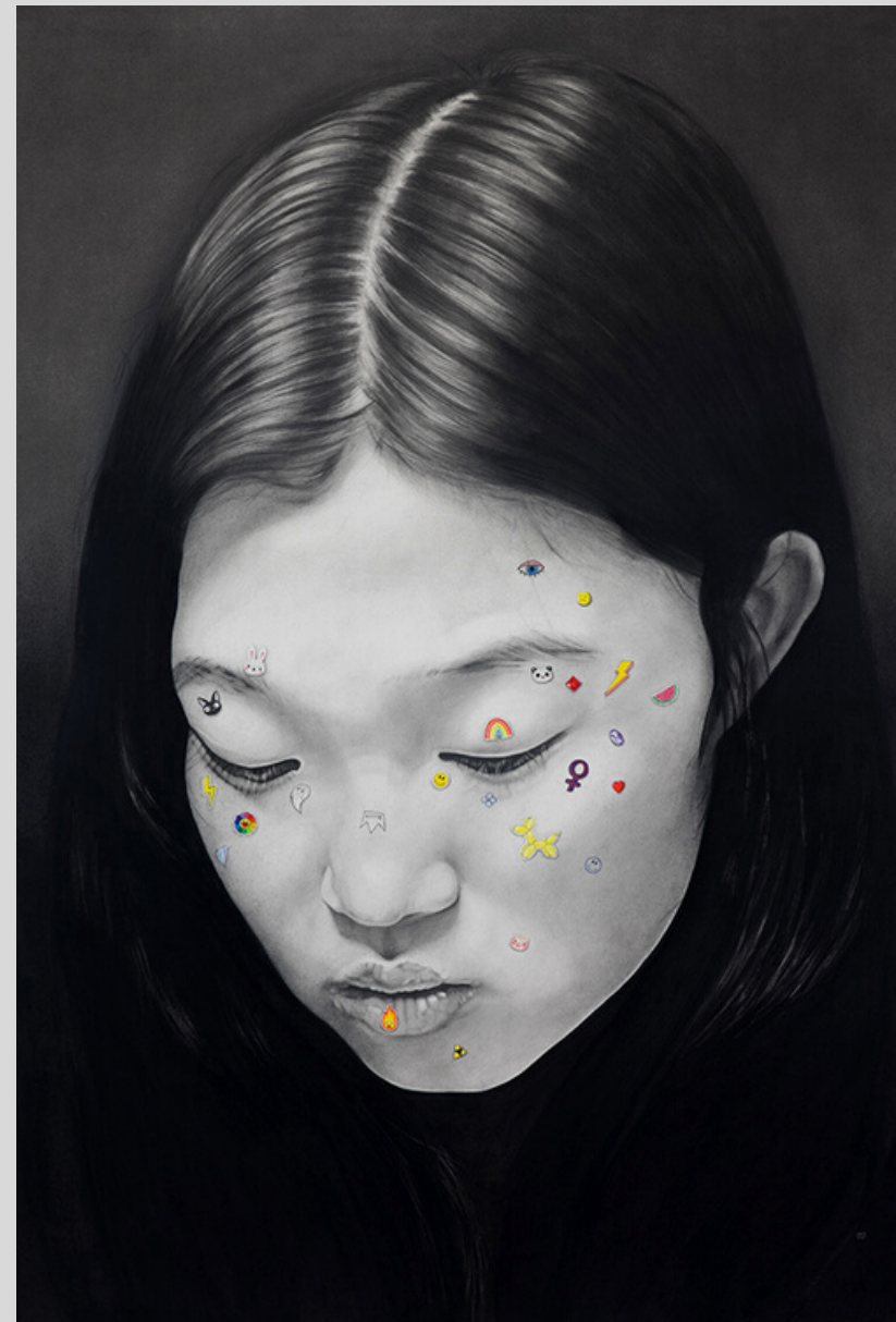
FAKE FUN size: 97 x 130 cm year: 2020

media: graphite, charcoal, coloured pencil, watercolour and water glue on paper mounted on wood panel