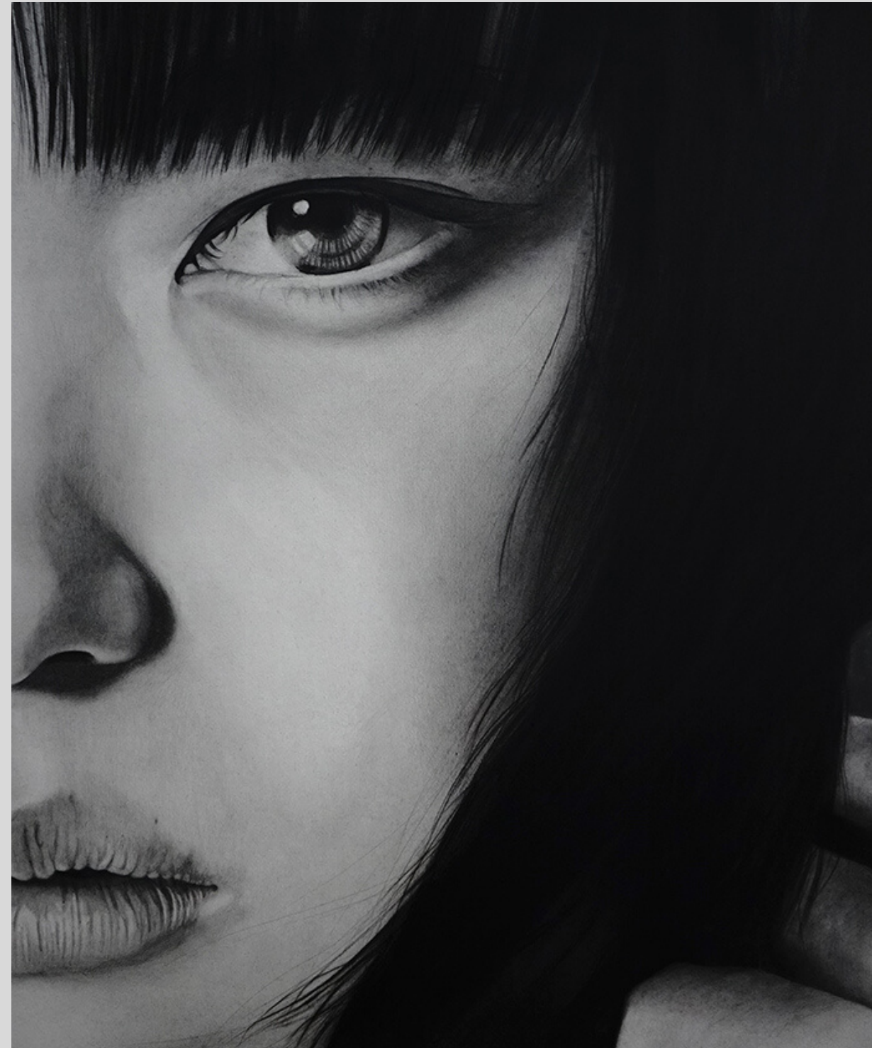
SPACE BUNS RADICAL (work and detail) year: 2022

graphite, charcoal, watercolour and water glue on paper mounted on wood panel