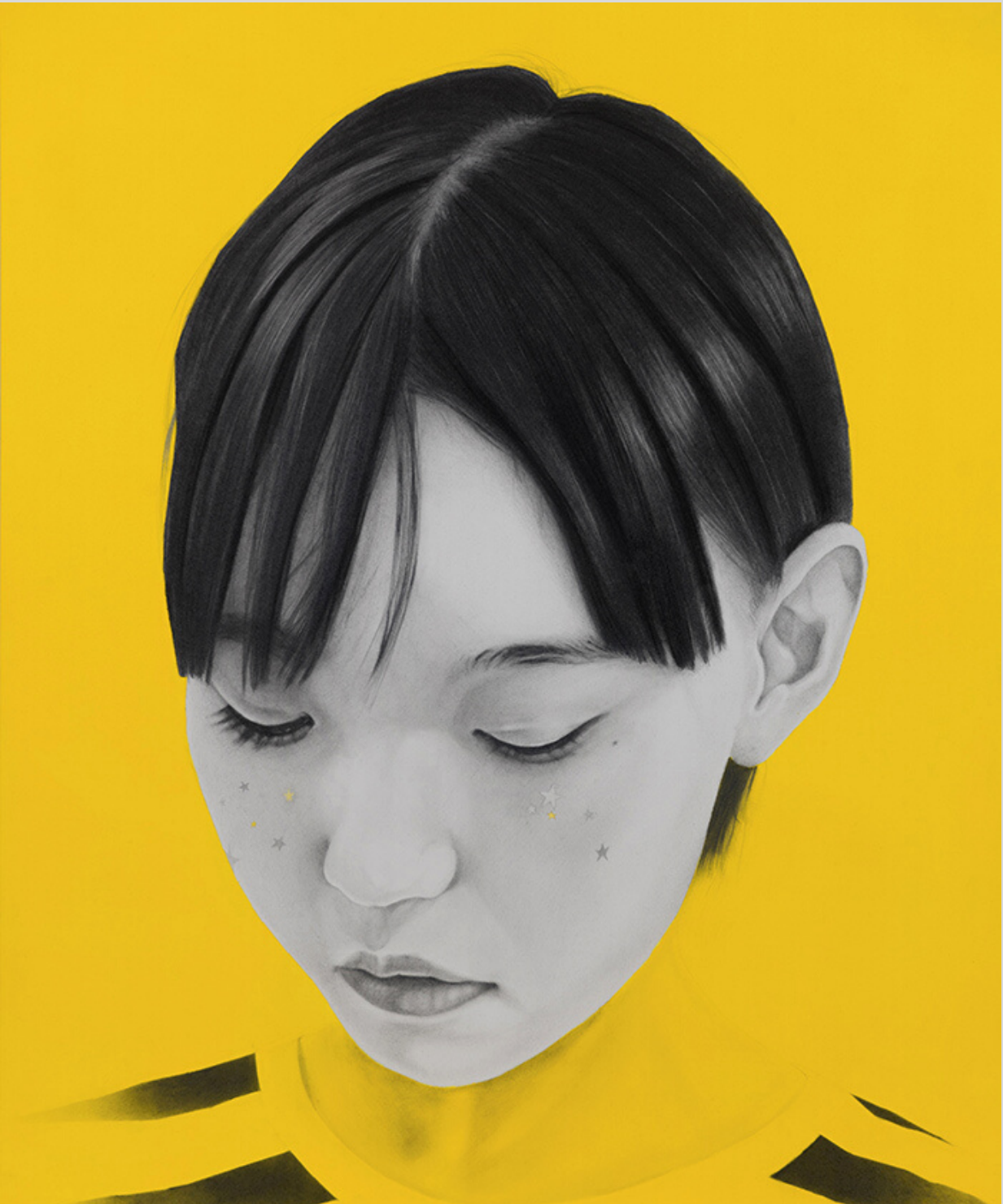
HUANG 5 / FIRE